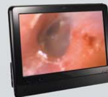
monitor / TV

Video port to provide simultaneous image to TV / monitor, or to download image to Mac / PC system.