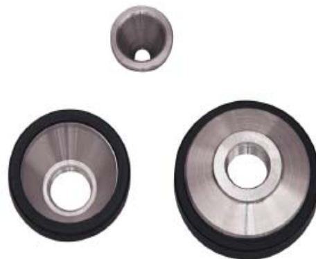
The 'Specialist' Chest Pieces - Pediatric, Adult Bell and Adult Diaphragm

The "Specialist" heads are machined from high-grade stainless steel with a Delrin non-chill ring. They provide a 50% increase in sound sensitivity, a reduction in outside noise and a comfortable feel.