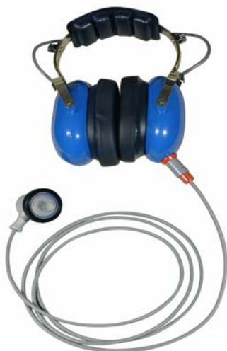
E-Scope EMS Electronic Stethoscope

EMS - paramedic? The E-Scope EMS provides exceptional s in noise area.