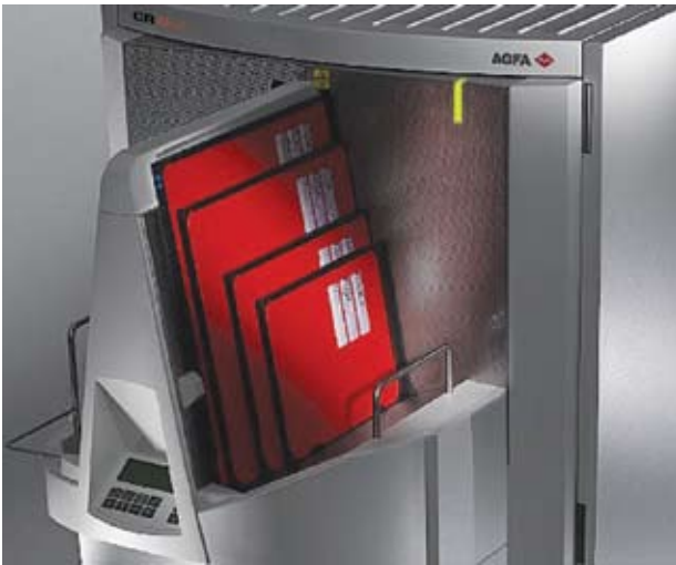
Integrated CR user station for time-saving identification and optimized workflow

CR 85-X reads imaging plates at a standard resolution of 6 pixels/mm. The high resolution mode of 10 pixels/mm is available for all image plate sizes.